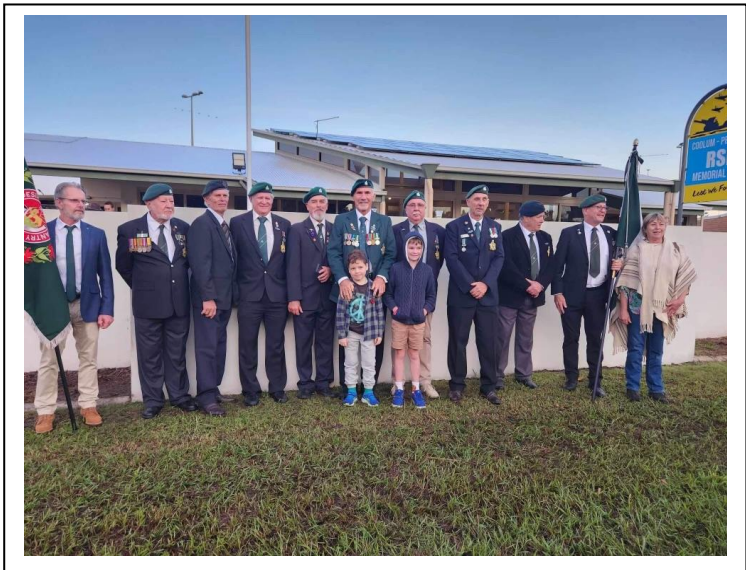
With some Family.