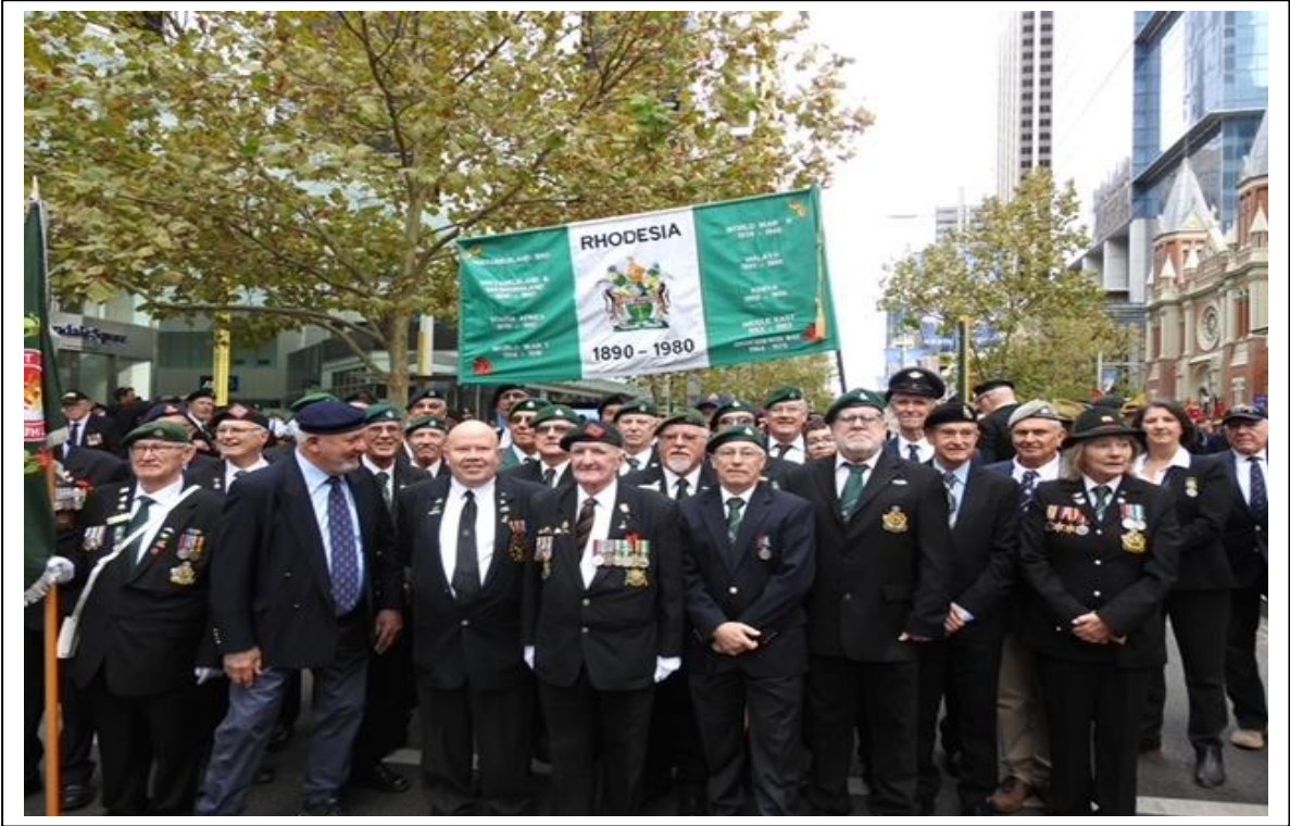
The Rhodesians getting ready to "Form Up" for the parade.