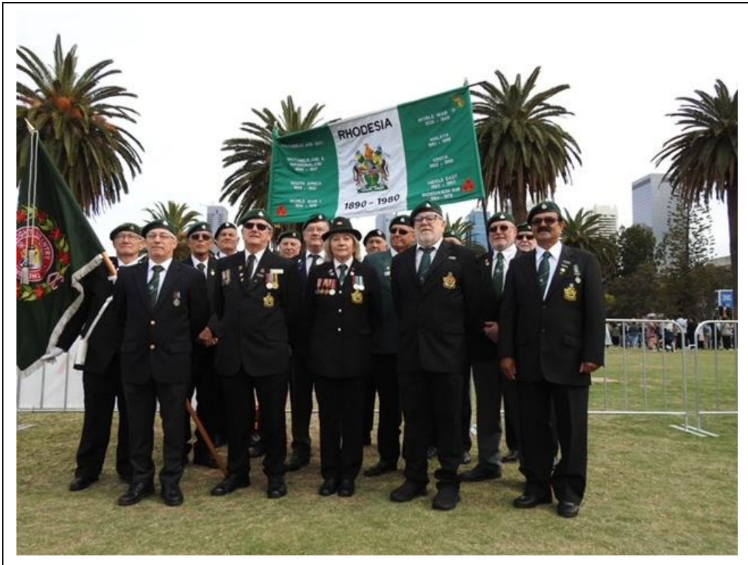
The RLI Contingent