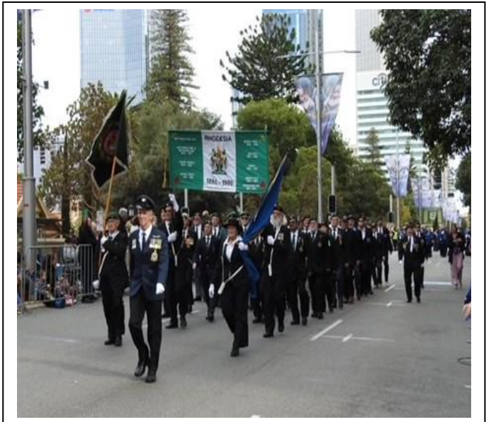
Rhodesians on parade