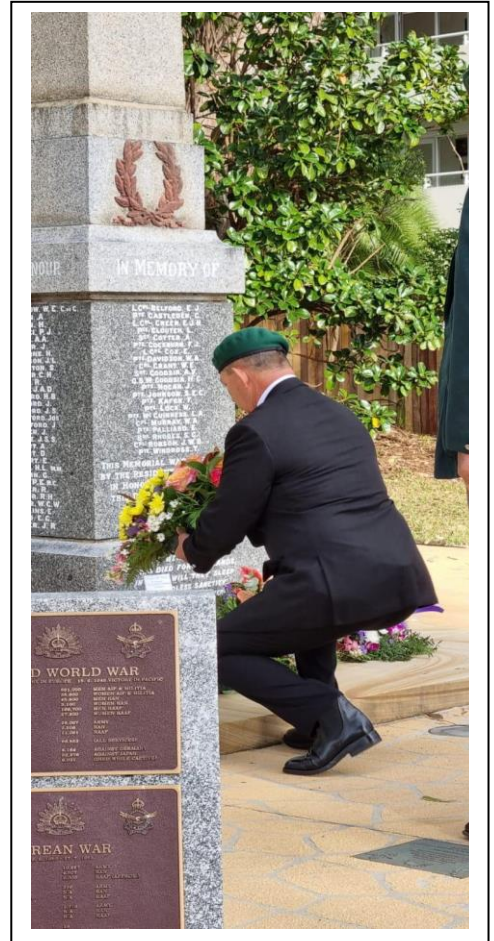
Laying the Wreath