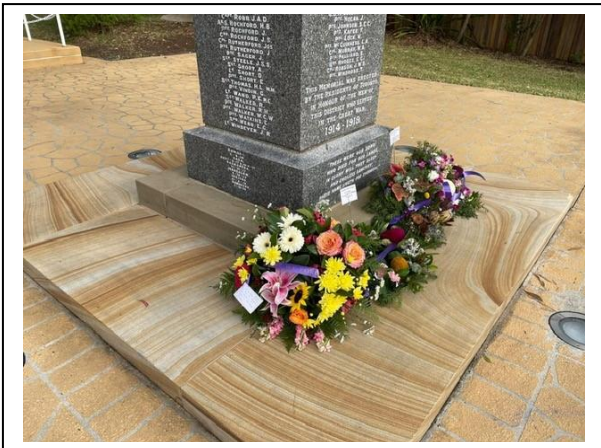
The Wreath to our Fallen