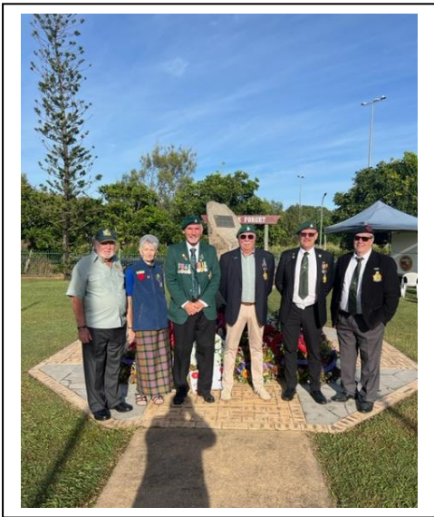
In front of the Coolum Memorial