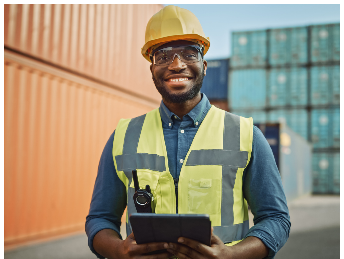
WELLNESS / INNOVATION / INTEGRITY / DETERMINED / PERFORMANCE / MOTIVATED